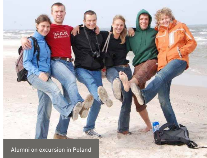
Alumni on excursion in Poland

During the fellowship practical solutions for current environmental issues are developed. After their stay in Germany the alumni are well qualified to tackle these issues in their home countries thus assuring efficient knowledge transfer. Working closely together in an international context helps to breakdown existing barriers. The acquired contacts will create a strong network of highly committed environmental experts.