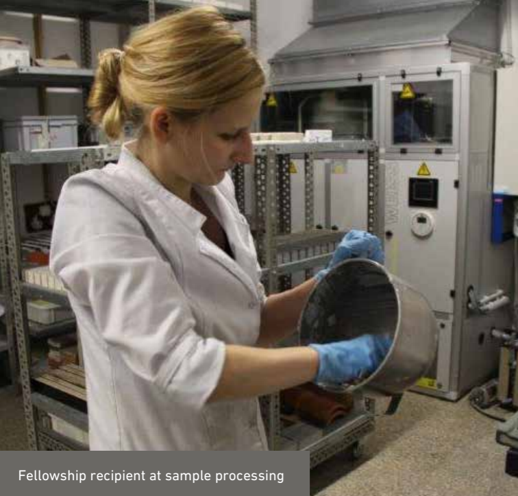
Fellowship recipient at sample processing