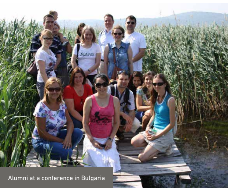
Alumni at a conference in Bulgaria

DBU coaches its fellows during the whole stay. During seminars the fellowship recipients can present their topics and their results and network with each other. Furthermore, DBU welcomes and supports individual initiatives to organize further professional events and seminars.